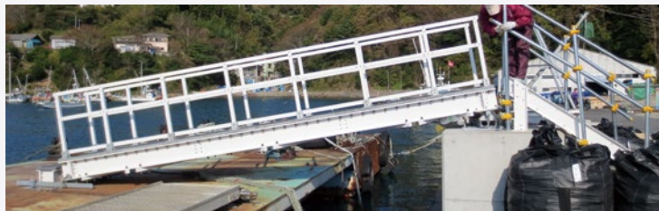
GFRP-UFC Pedestrian Bridge in Onagawa, Miyagi Prefecture

In this study, glass FRP (GFRP) and ultra-high-strength fiber reinforced concrete (UFC) composite beams were developed for the construction of short-span pedestrian bridges. The main advantages of using GFRP-UFC composite beams for bridge construction are the durability and the rapidity of construction. The durability of the GFRP-UFC composite beams has been significantly enhanced by using high corrosion resistant materials. The UFC segments were used to prevent the premature delamination of the GFRP I-beam compression flange and to increase the stiffness and flexural capacity of the I-beam.