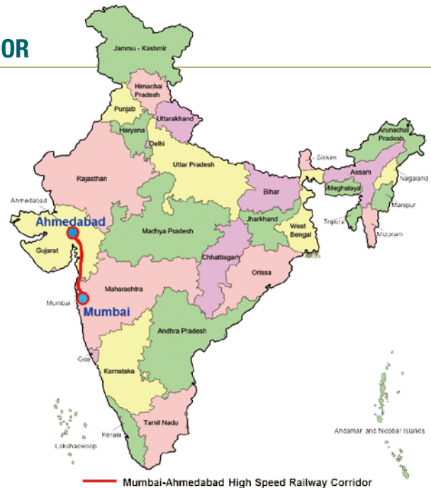
Figure 1: Map of India with Mumbai-Ahmedabad High Speed Rail-way Corridor

The Japanese Shinkansen technology is to be adopted for the corridor. Moreover, approximately 20% of the components will