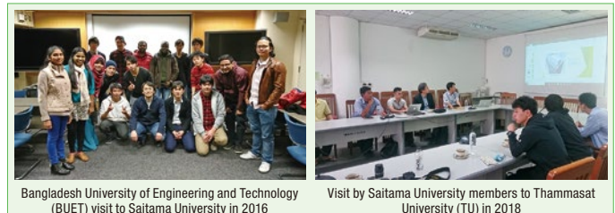
Figure 2: Recent visits of SU to associated universities and vice versa