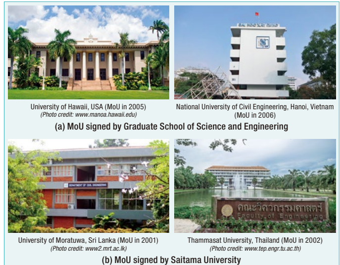
Figure 1: Collaboration activities managed by the department of Civil and Environmental Engineering

The acceptance of short-term student exchange program (2017-2018) under Japan Student Services Organization (JASSO) showcases the success of our international collaborative efforts.